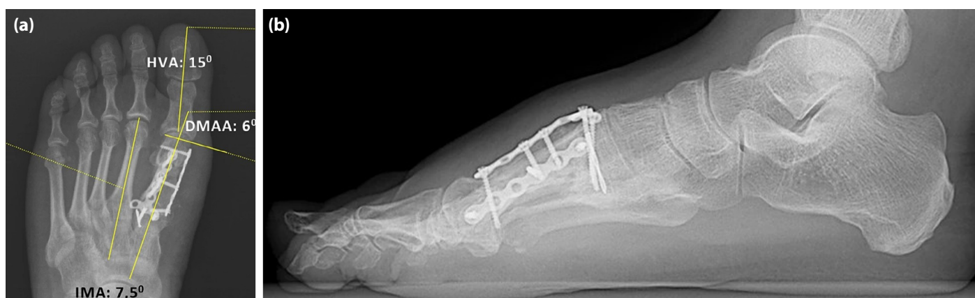
Figure 3. Postoperative weight-bearing X-rays at three months. (a) Anteroposterior view showing hallux valgus angle (HVA): 15°, intermetatarsal angle (IMA): 7.5°, distal metatarsal articular angle (DMAA): 6°. (b) Lateral view.