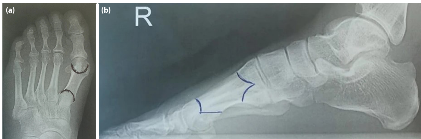
Figure 2. Preoperative planning of osteotomy lines. (a) Dorsal view, (b) Lateral view.